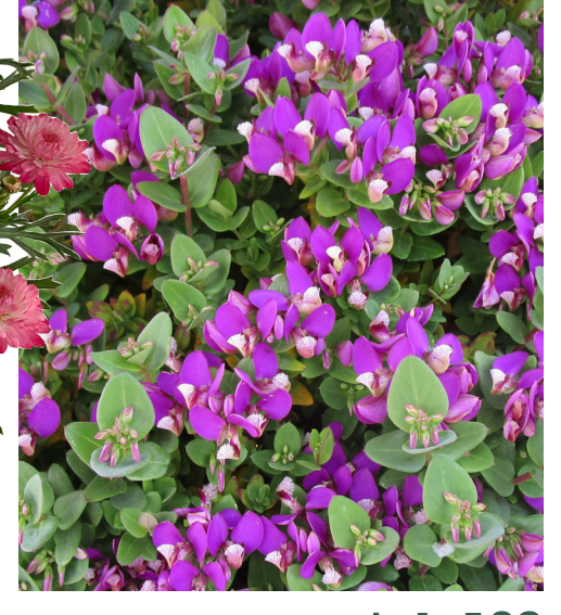
Polygala Little Poly

A truly stunning daisy, as they are commonly called. Dark pink flowers cover the compact plant growing to 60cm high and 50cm wide. 150mm pot