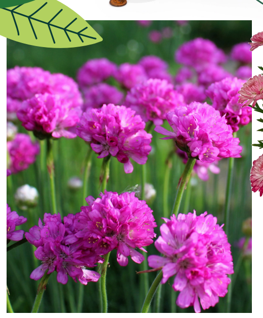
Ameria Bees Ruby

You will love these happy smiling faces hanging over your pot to add a touch of whimsy to your indoor or patio pots. A choice of three colours.