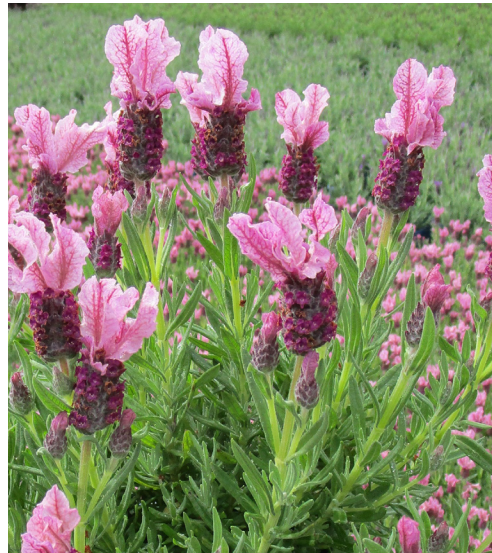
Lavender Loveheart $

An old favourite which is just perfect in South Australian gardens – free flowering with lovely light purple blooms. 150mm pot